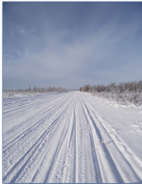
The Winter Road is now finishing construction

The Attawapiskat First Nation section is being built as far as Big Willow River by the Kattawapiskak Development Company while the Kashechewan First Nation will be building a section and maintaining the road as far as Kapiskau once it is built. Fort Albany First Nation will also be building a section of the road, stretching from the midpoint of Albany Island to Halfway Creek. Finally, Innlink Concrete was selected as the contractor for the section of the