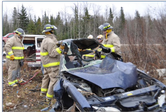
Practicing how to save lives by taking the roof off a "stranded" car during Auto-Extrication Training

First, the vehicles were stabilized using blocks and the airbag was also secured. The doors and car roofs were then removed along with the steering wheels to gain access to the trapped victims. Each trainee was given the opportunity to practice the tasks involved in auto extrication.